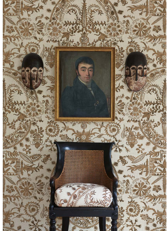
50 Scale Henna Wide Width Wallpaper