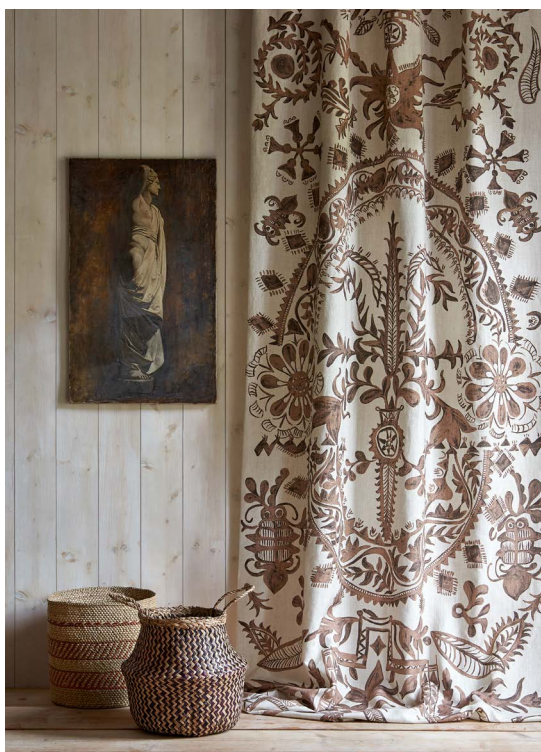
100 Scale Henna Fabric 56% Linen 44% Viscose