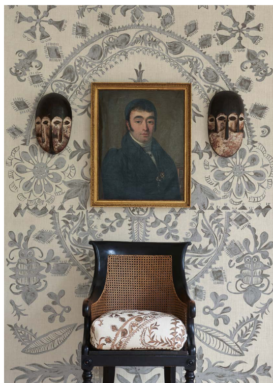
100 Scale Northlight Wide Width Wallpaper