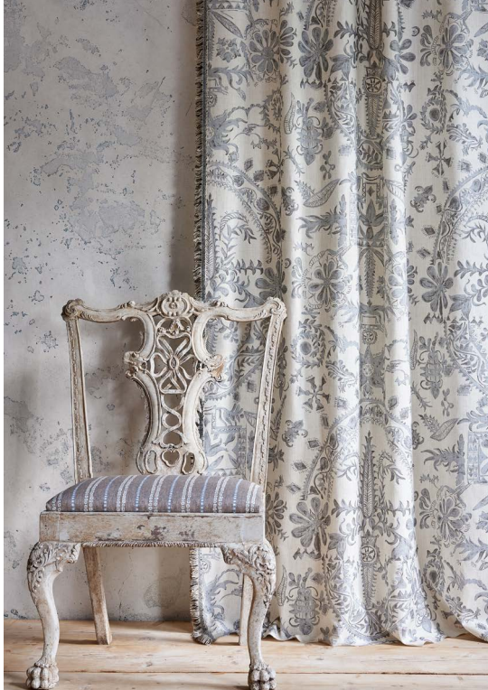
50 Scale Northlight Fabric 56% Linen 44% Viscose