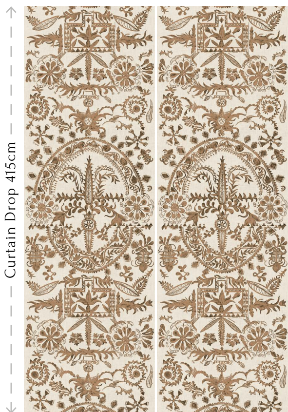
Drop 1 Drop 2 Straight Repeat