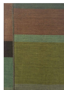
GELIM STRIPE Myrtle