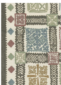
PALMYRA Terra Firma