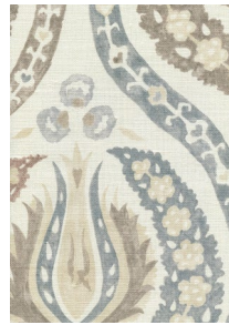
BENAKI Blue Umber