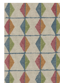
JACKO Tutti Frutti