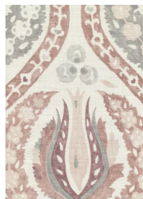
BENAKI Rock Rose