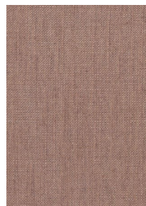
OAKSEY LINEN Roan