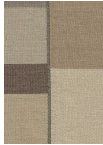
GELIM STRIPE Casement