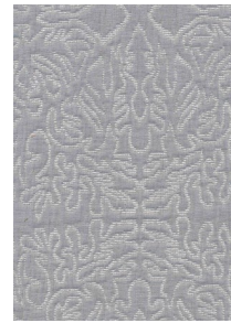
STOCKHOLM North Light