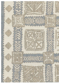
PALMYRA Blue Sand