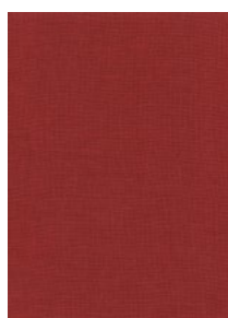
LIGHT LINEN Medoc