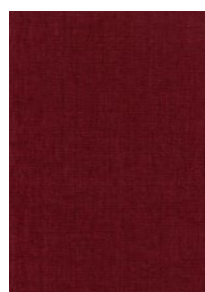
MONTE LIMAR Damson