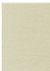
KEMBLE LINEN Parchment