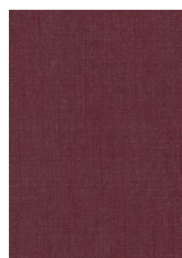
OAKSEY LINEN Cranberry