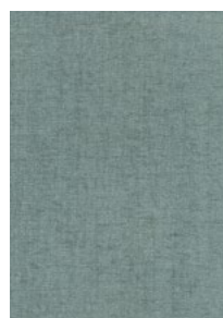
MONTE LIMAR Cadet