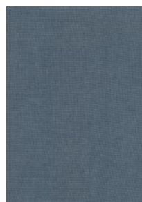
LIGHT LINEN Denim