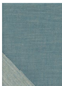
BIRDLIP TWILL Marmara