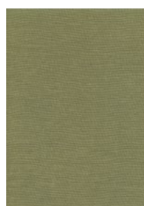
LIGHT LINEN Limpopo Green