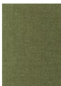
MONTE LIMAR Myrtle