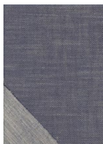
BIRDLIP TWILL Denim