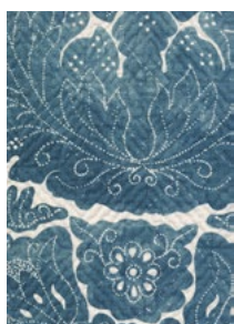
NANTES Baltic Blue

Composition 51% Linen 42% Cotton 7% Nylon Rub Test 25,000