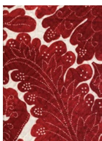
NANTES Madder Red