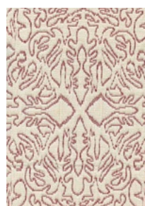
STOCKHOLM Cream Red