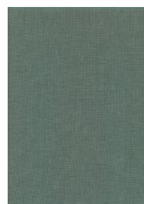
LIGHT LINEN Ocean