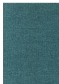
MONTE LIMAR Turquoise