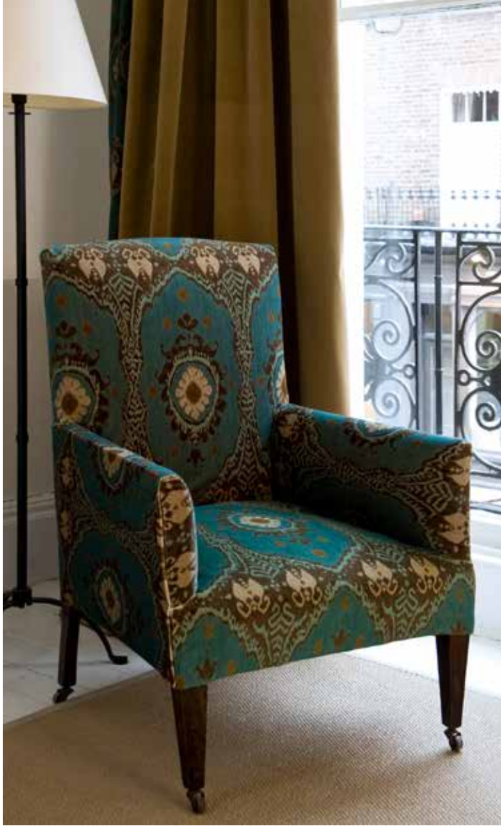
A design inspired by nomad weavings from the Hindu Kush, NIKITA is a luxurious cloth which works well with contrasting wood and leather interiors.