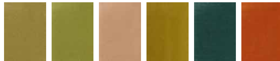
Fawn Green Gage Hellebore Inca Marmara Marmalade