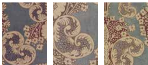
Imperial Mughal Siam