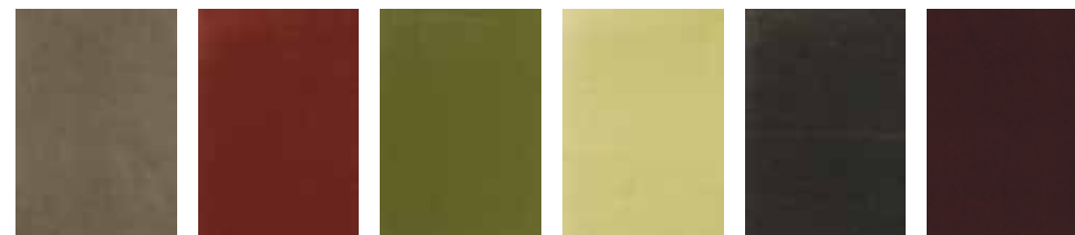
Moss Mulberry Myrtle Onyx Otter Peat