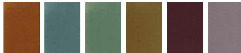
Amber Blue Boy Cadet Cocoa Damson Dove