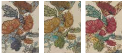
Copper Cobalt Ginger Kiwi Red Emerald