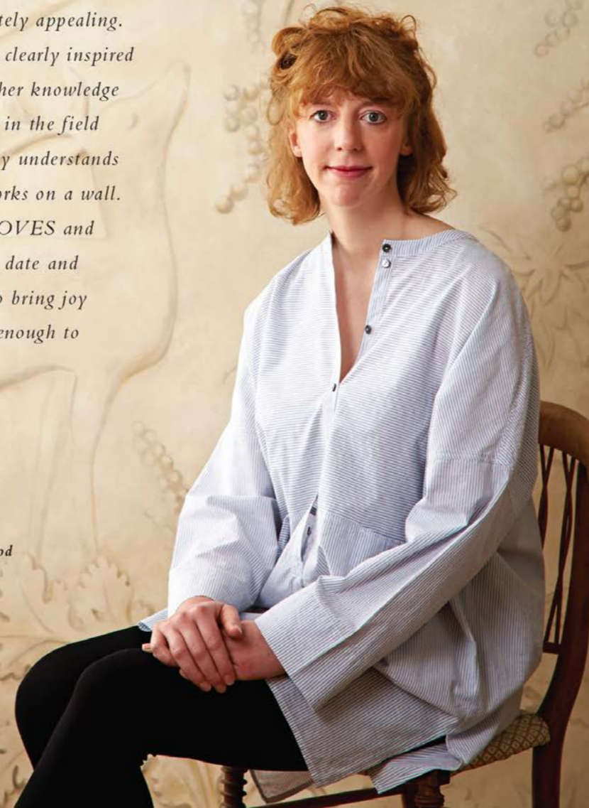
SIKA Sandalwood wallpaper panels