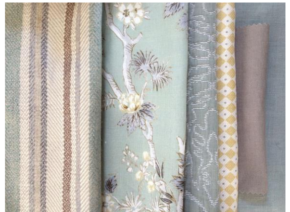
Mineral plus patterns and plains

A useful and very handsome addition to our fabric collection, this bold striped linen and wool mix has a surprisingly soft texture.