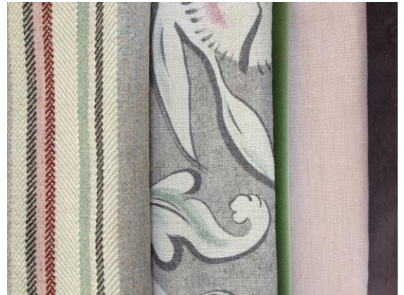
Heather plus patterns and plains